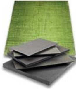
MOLDED & WOVEN FLAT SHEETS