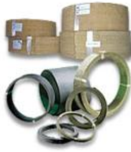
MOLDED & WOVEN ROLL LININGS