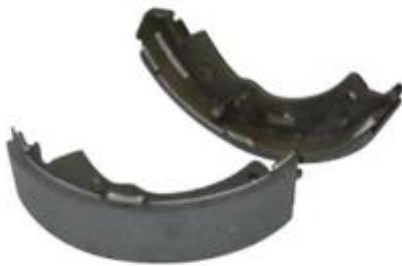
Lift Truck Shoes