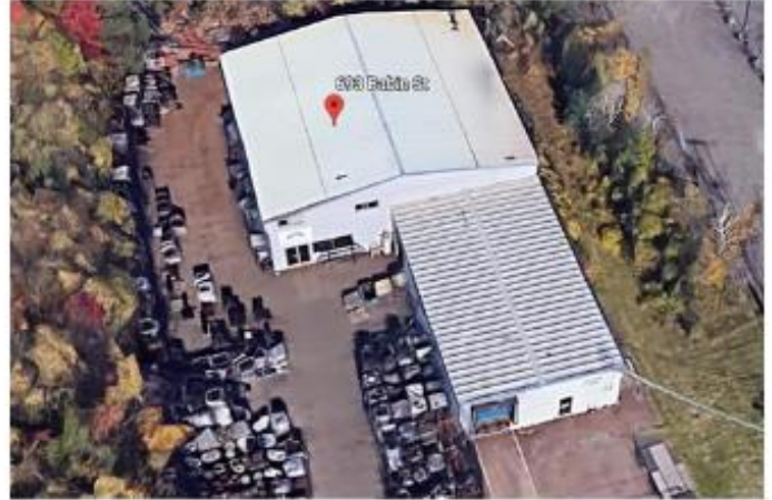
Factory, Dieppe, NB Canada

Many of the recent innovations used in bonded industrial clutch and brake technology were originally developed and conceived by . A dedication to continuous improvement and customer service support make us an ideal partner for your industrial braking solutions.