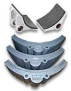
OVERHEAD CRANE BRAKE PRODUCTS

ATLANTIC FRICTION INC. IS A CUSTOM FABRICATOR & DISTRIBUTOR OF SPECIALTY FRICTION AND BRAKE SHOE ASSEMBLIES FOR OFF - HIGHWAY & IN - PLANT APPLICATIONS