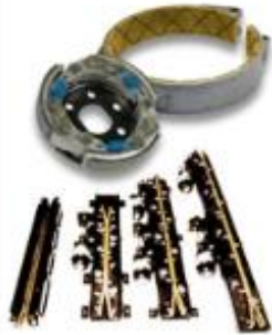
CUSTOM FABRICATED BRAKE PRODUCTS