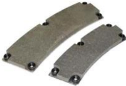
Integrally Molded Parts