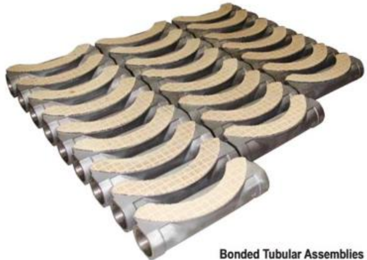
Bonded Tubular Assemblies