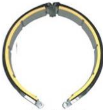
2000 Ton Brake Band 8" x 98"