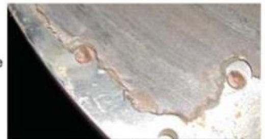
Damaged Riveted Plate