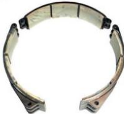
3-Piece Brake Band