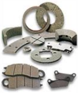
WOVEN & MOLDED CLUTCH FACINGS